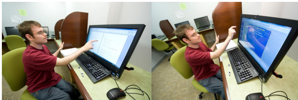
Student using touch screen in assistive technology lab.