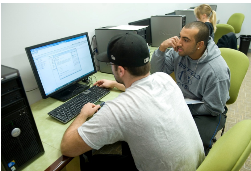
Student with a tutor in the Banacos computer lab.